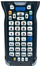
NUMERIC WITH FUNCTION KEYS

Both keypad options feature hard keycaps with wear-resistant, laser-etched legends.