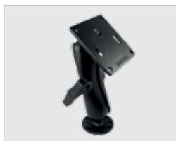
Ball joint mount